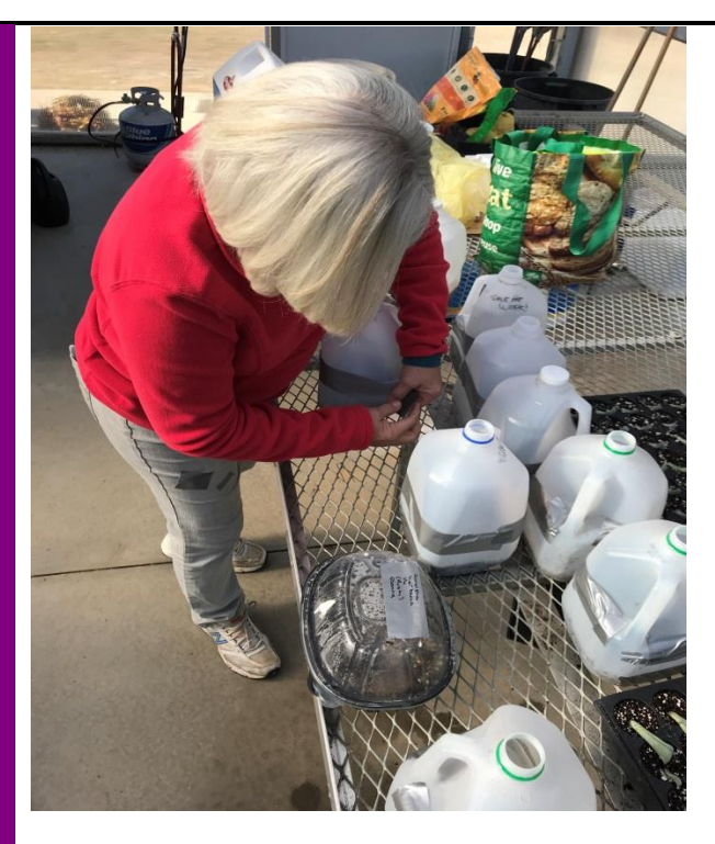
Wintersowing milk jugs are taped up for outside seed stratification.