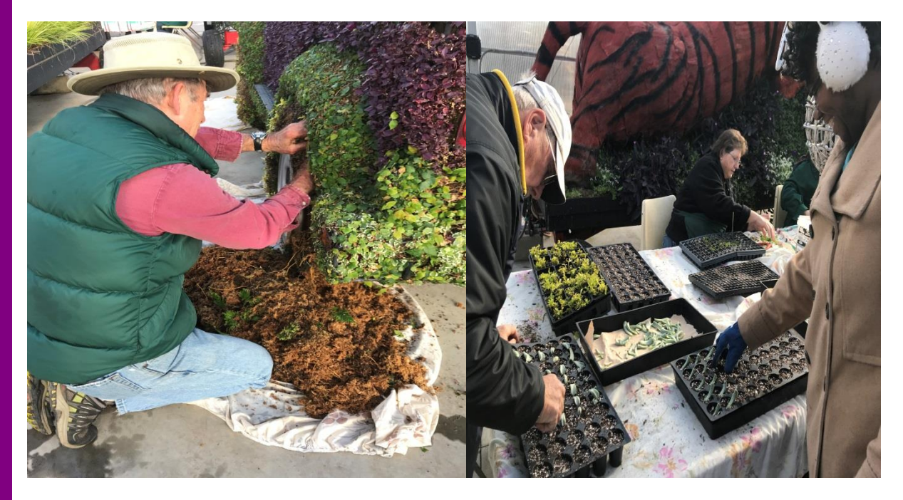
Jeep tires are deconstructed to be repaired and plugs are created from cuttings for the 60,000 topiary plants required.