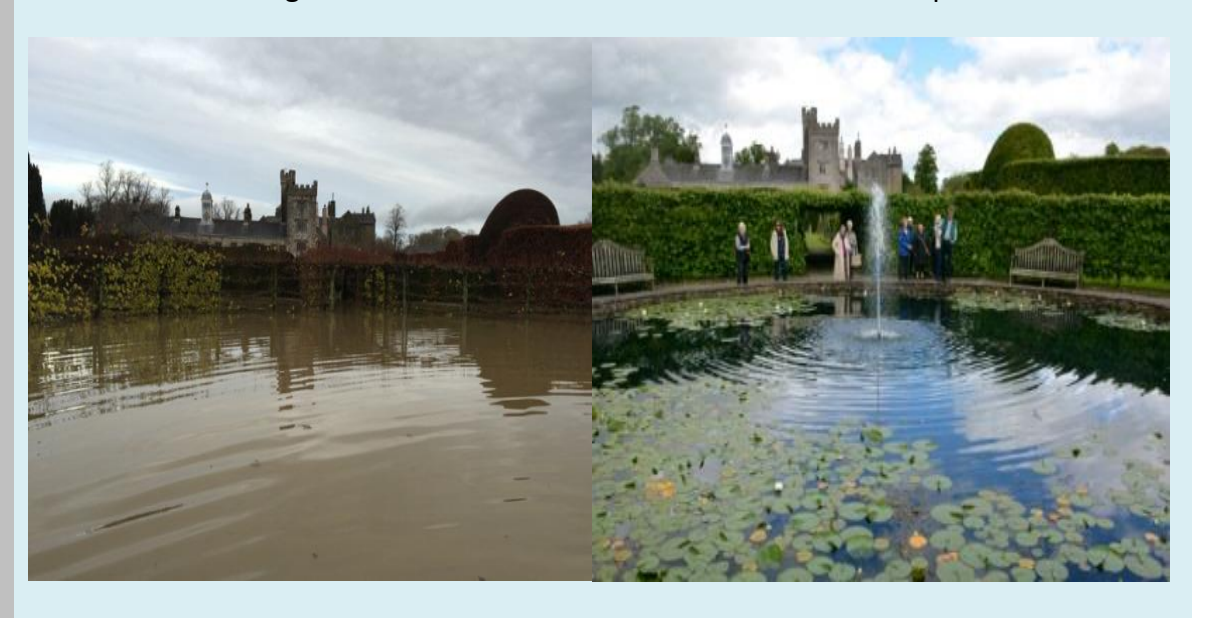
Flooded Fountain garden in Dec.

Levens Hall in Cumbria, (around Manchester and York), is the home to the oldest topiary collection in England. The 350 year old trees and older house are seen here after the devastating floods this Christmas and unflooded in June the prior summer.