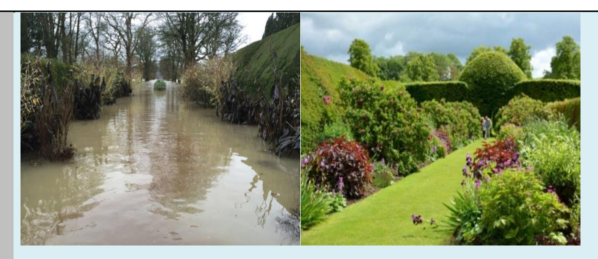
Flooded red border