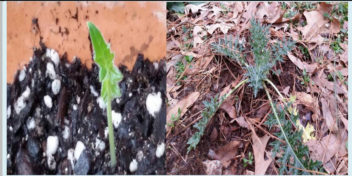
Saucer with leaf emerging from rootlet