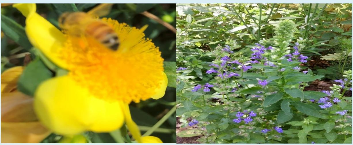
St. Johnswort or Hypericum with unusually large flowers. Lobelia syphilitica has long bloom period.