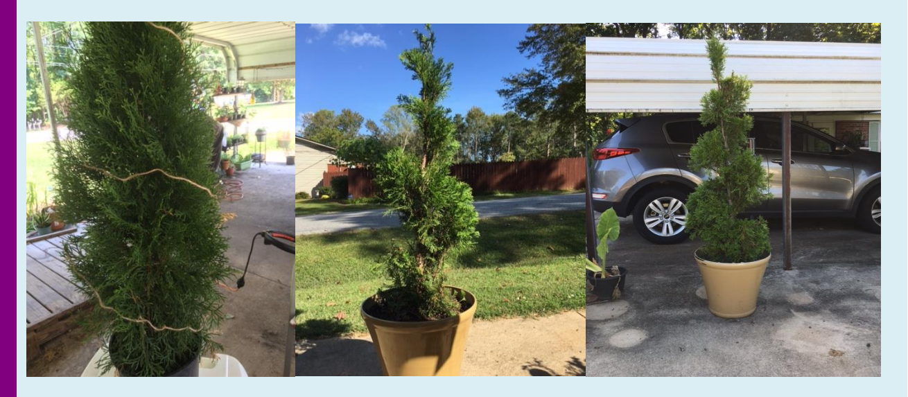
From undisciplined raggedy mess to tightly sculpted masterpiece. Great job Jimmy Scissorhands.

I hope you will share your garden experiments with us. We all learn from each other's experiments.