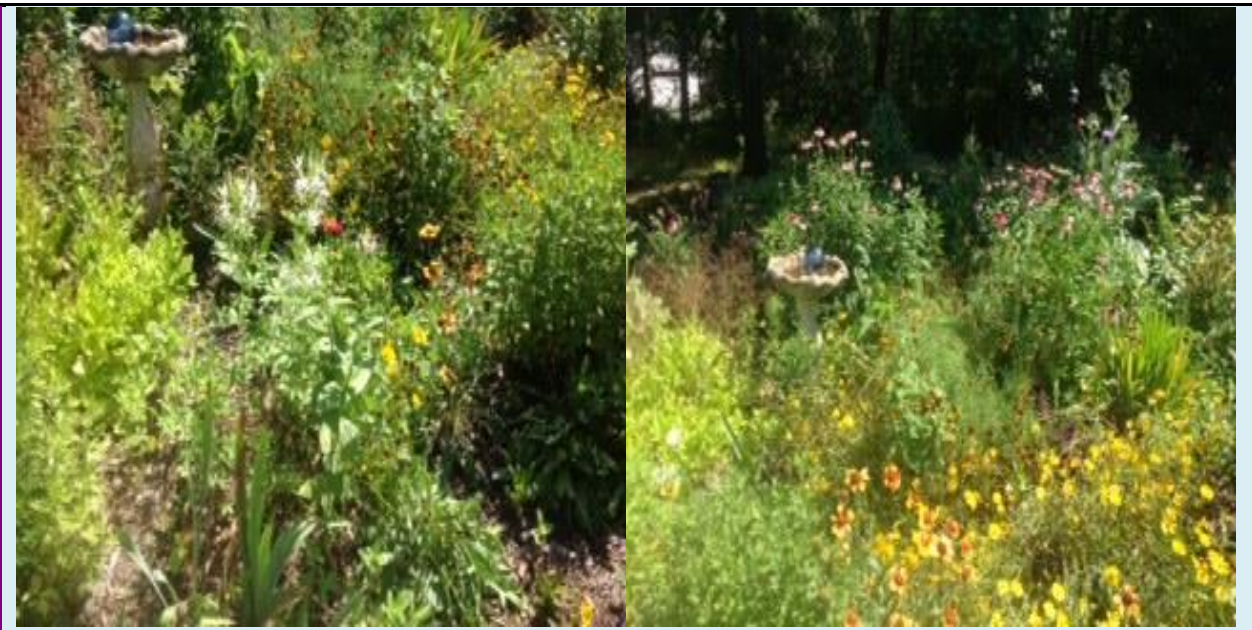
Sherry Edwards bee-friendly blousy meadow planting with cleome, gaillardia, and coneflower