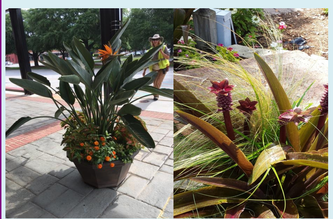
Bird of Paradise, coleus, and marigolds.