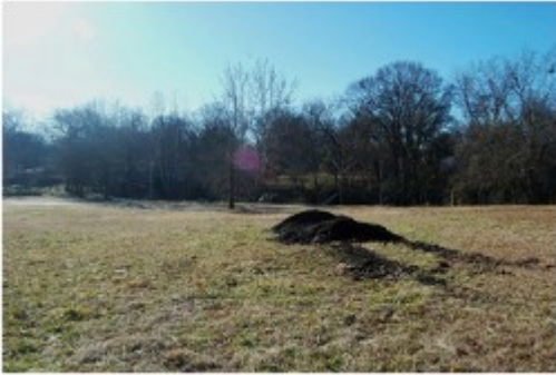
Dreaming of what could be!!

A pictorial narrative of this community garden.