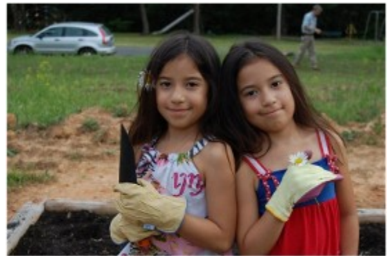
Ashanti & Shania ready to work!