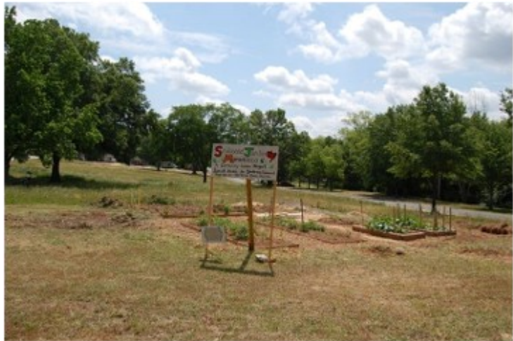
Soon we will have produce to pick!

Thanks to all who have assisted with Seaboard Jardin Maravilloso