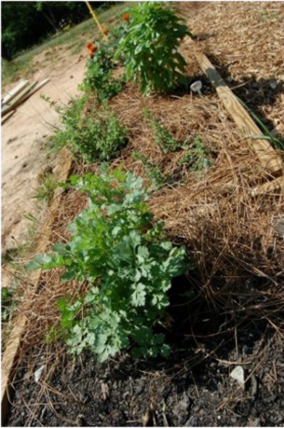
Raised herb garden