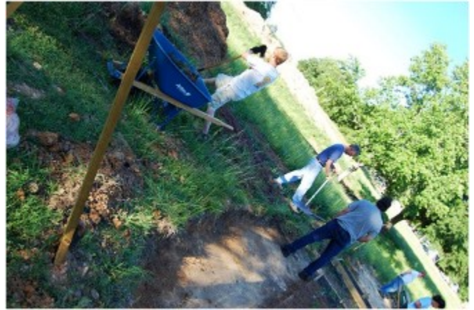
Many hands make light work!