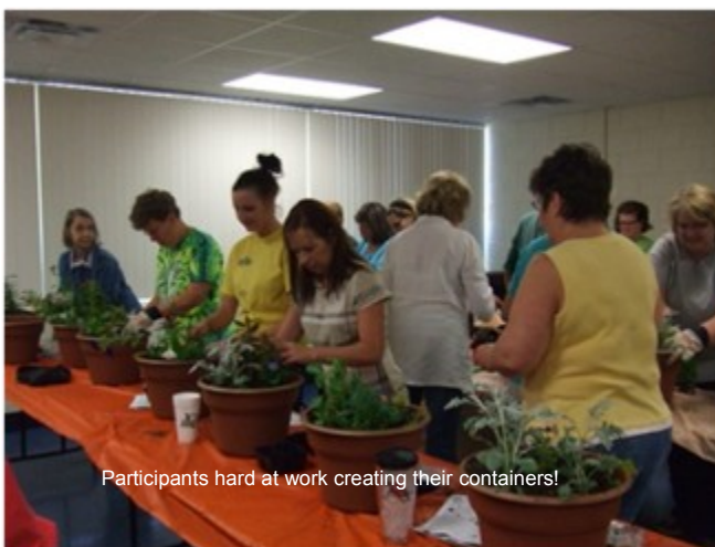
Participants hard at work creating their containers!