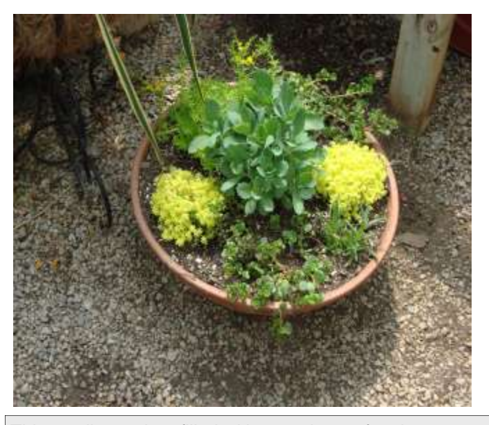
This small container filled with succulents of various sizes ,colors and foliage types displays only a few of the choices available. There are plants suited to various light and growing conditions available too.

One thing to keep in mind is that many of the new plants are not winter hardy outside in the Lakelands. Select hardy outdoor plants if your intention is to create a permanent planting. Many succulents fit small containers that can be moved inside during the winter.