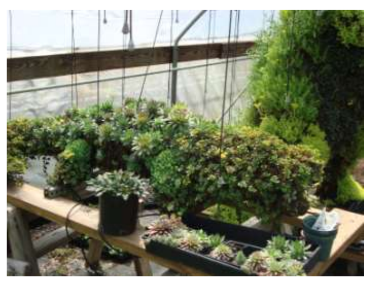
The topiary alligator (covered with succulents) spends the off season in a local greenhouse to protect freeze sensitive plants

The few past selections of hen and chicks (Sempervivum tetorum), or hardy cactus did not give consumers many choices. By contrast, succulents in particular, have been hot in recent years with plant breeders and developers as they released many new and interesting plants for the market. A large selection of plants in various colors, texture, floral displays and plant forms are now available.