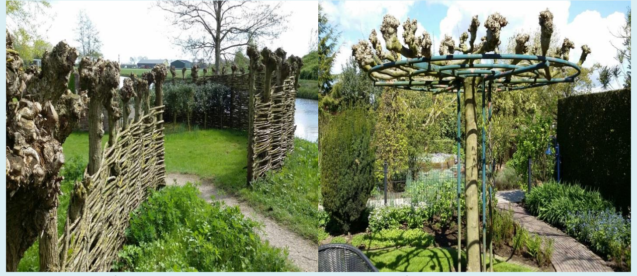
Pollarded trees are fence stakes with wattle between. Co

The Keukenhof Flower Festival outside of Amsterdam was at its peak on April 20<sup>th</sup>. These photos are unretouched and were taken by a fairly lousey photographer. The vividness of the flowers overcame all deficits. The Dutch are all Master Gardeners. They don't leave a tree unshaped. It seemed everyone had a pollarded tree in their yard. All scraps were used from this pruning process. The "brashings", or thin whips, are used to support perennials or make waddle fencing. Tree stumps are piled to create walls. I could just about live there, except you have to wash your windows every morning.