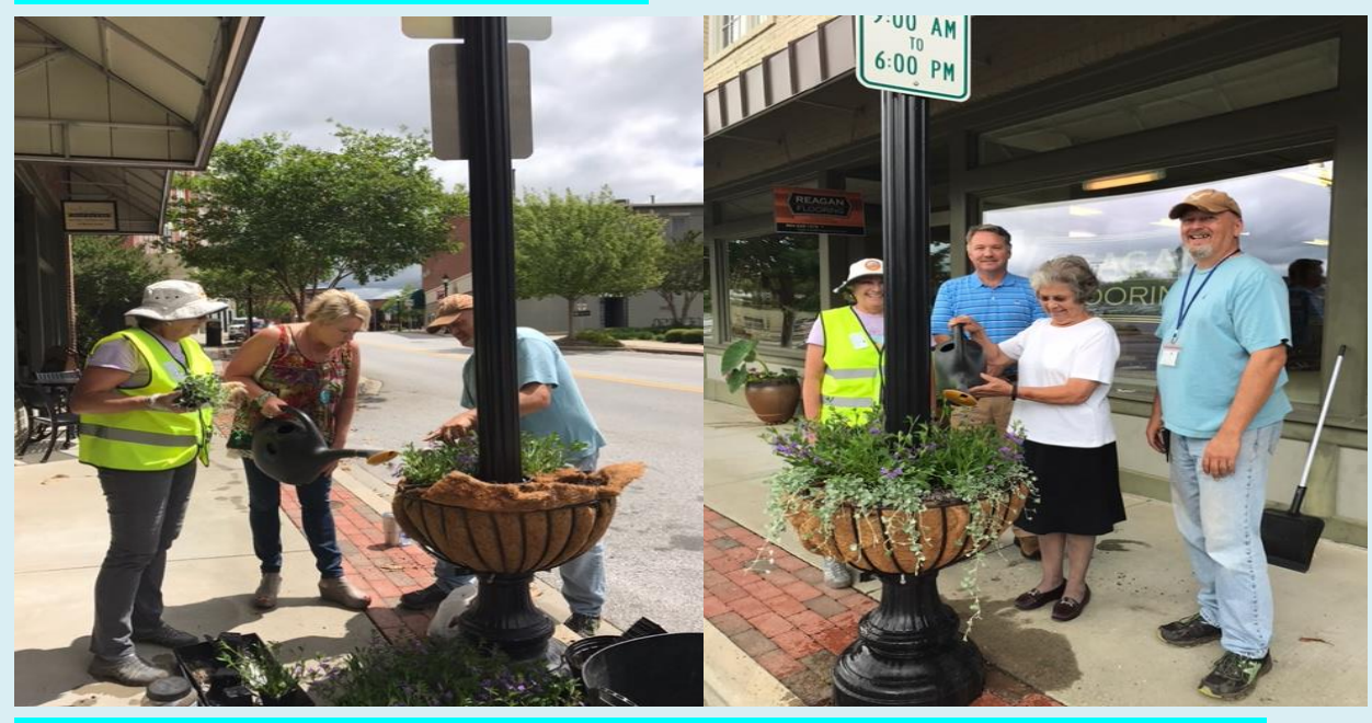
FARMERS MARKET PLANTING AND GREEN ROOF BIRDHOUSE PLACEMENT