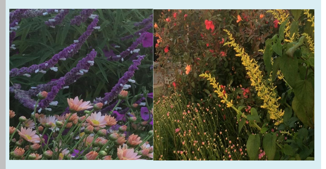
Salvia Leucantha/Chrysanthemum '?'