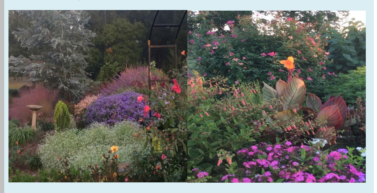
Euphorbia 'Diamond Frost'/Aster '?'/Salvia Leucantha