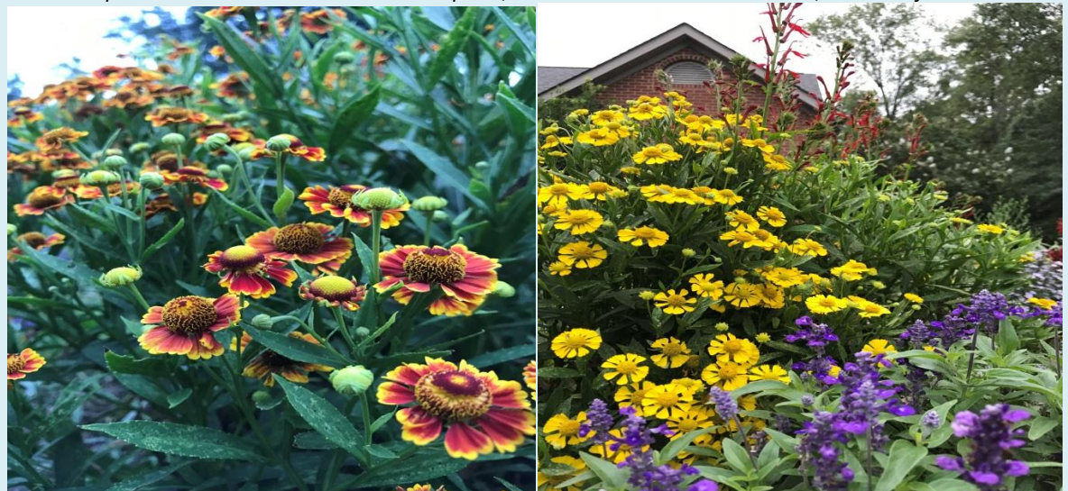
Two different heleniums or sneezeweeds bloom in Ann's garden. The pollinators thank her.