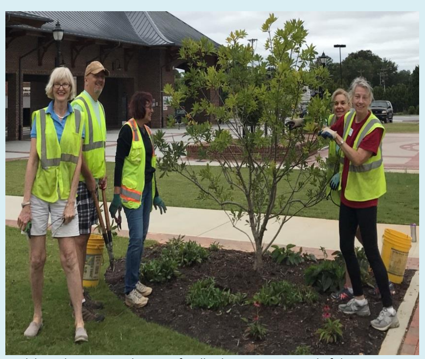
Look how thin we are when I artificially elongate it. Several of the new Master Gardener class are already earning hours!