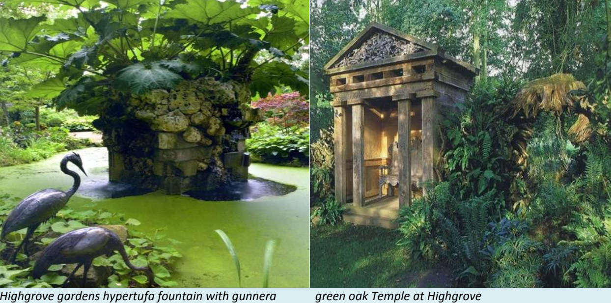
Highgrove gardens hypertufa fountain with gunnera