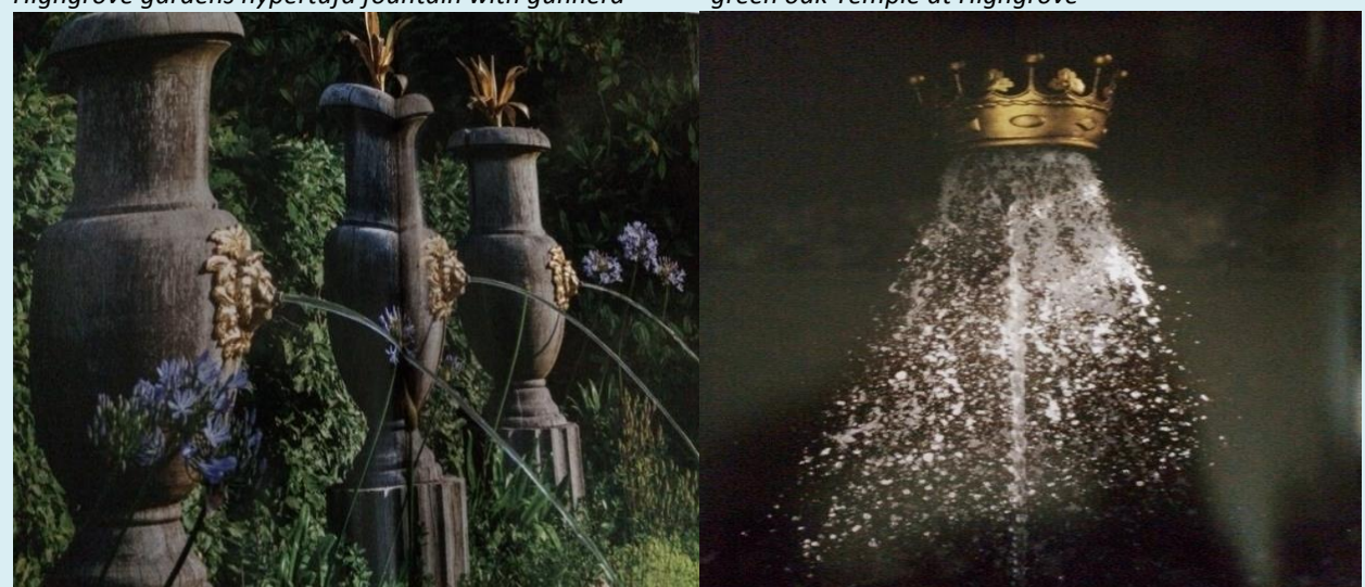
Gilded brass agaves in green oak pots